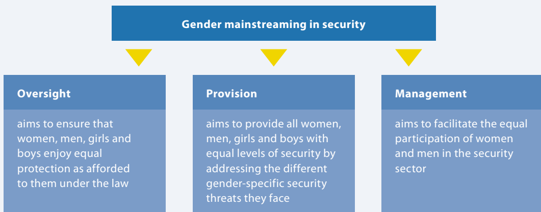
Figure 2 Goals of gender mainstreaming in three areas of security sector governance

Figure 3 (next page) shows some starting points for gender mainstreaming at every stage of SSR assessment, design, planning, implementation, monitoring and evaluation.